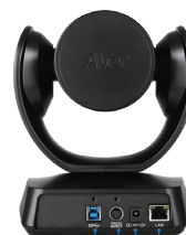
USB 3.1 type-B RS232 in/out LAN for IP streaming/ remote access DC 12V