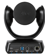
DIP switch HDMI out USB 3.1 type-B LAN for IP streaming and Power over Ethernet (PoE) DC 12V RS232 in/out