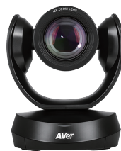
H182 x W142.7 x D153 mm