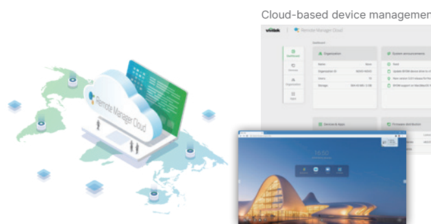
Dashboard, Device snapshot & Remote control