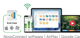
NovoConnect software | AirPlay | Google Cast